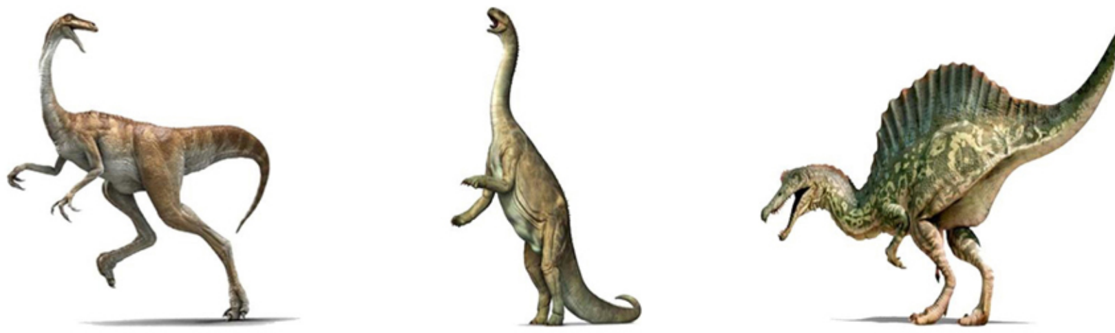
SOME "DINOSAUR ART" IMAGES

"Dinosaur Park took Dubai by the storm last season, and created a record with the 100 animatronics Dinosaurs on display. Designed and crafted to educate and entertain, the Dinosaur Park has ticked all the right boxes when it comes to striking a balance....." is what the reporters said.